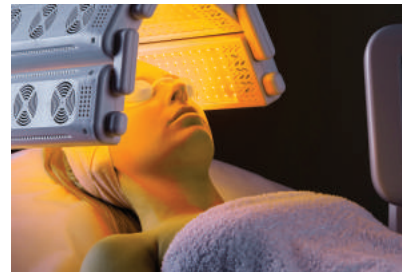
Light Therapy Treatment